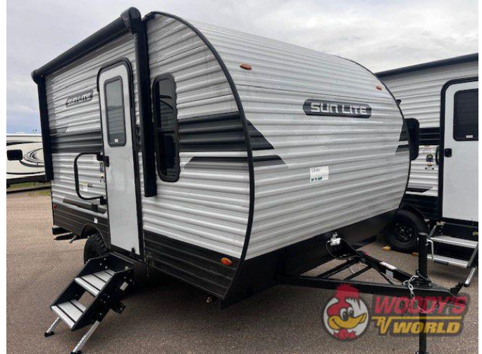
13 MJ LTD