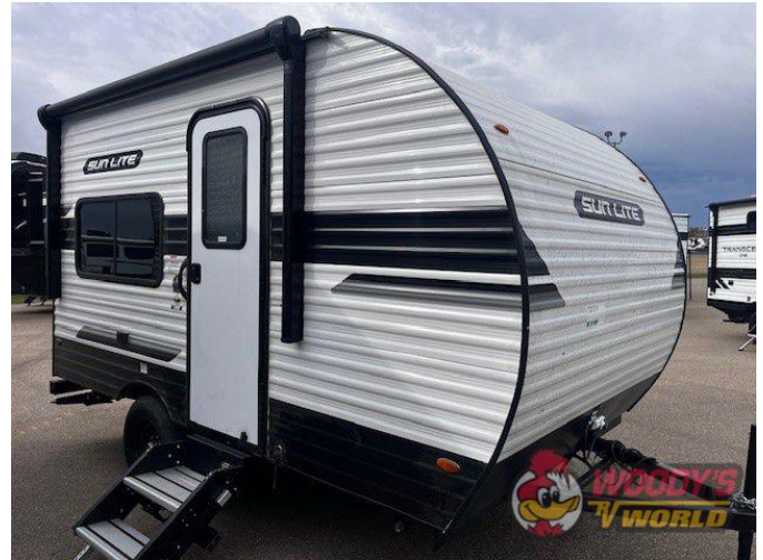
13 BD LTD