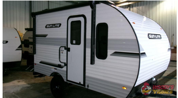
13 MJ LTD