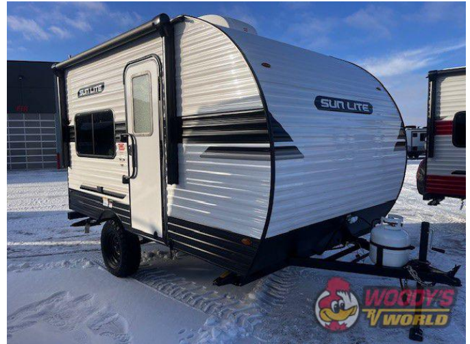
13 BD LTD

Disclaimer: Product information, pricing and photos are as accurate as possible and are subject to change without notice.