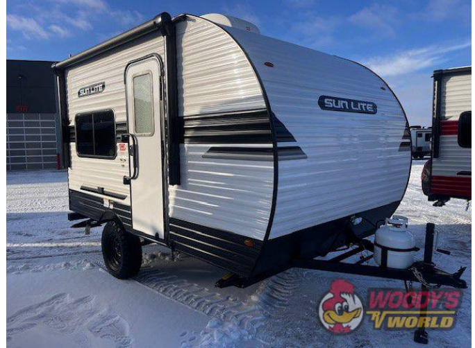
13 BD LTD