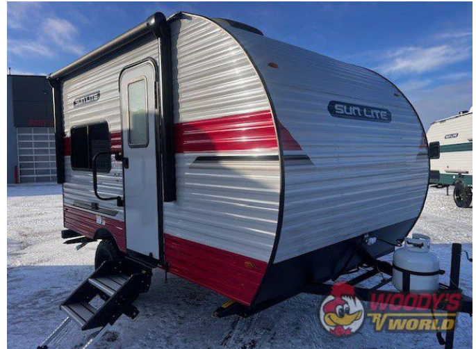
13 BD LTD