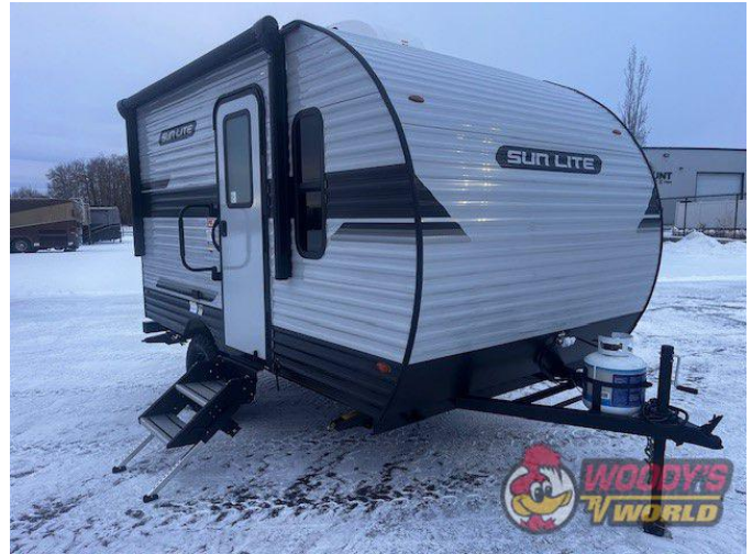
13 MJ LTD