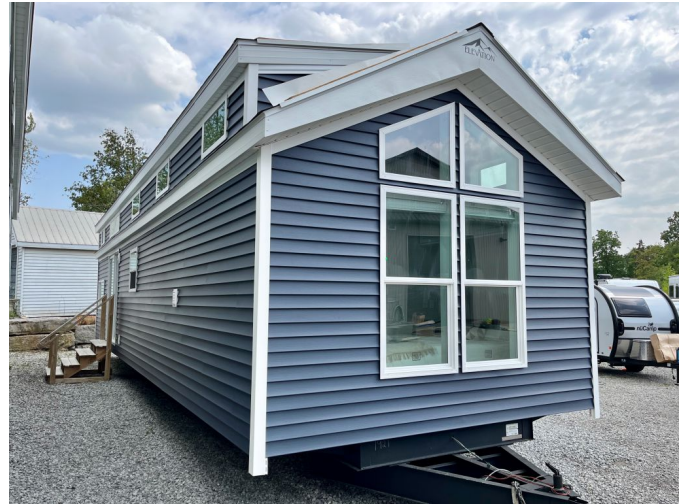
Elevation Park Model Company Floorplan 5-122 &amp; 7-122, Non-Loft Unit