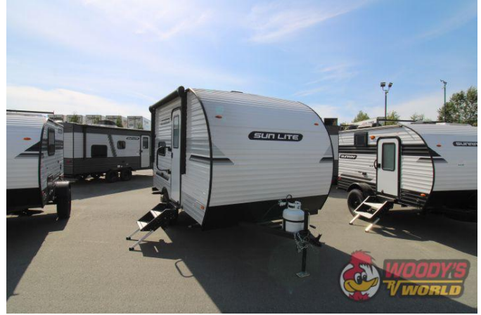
13 BH LTD