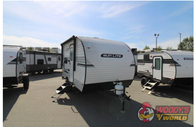
13 BH LTD

Disclaimer: Product information, pricing and photos are as accurate as possible and are subject to change without notice.