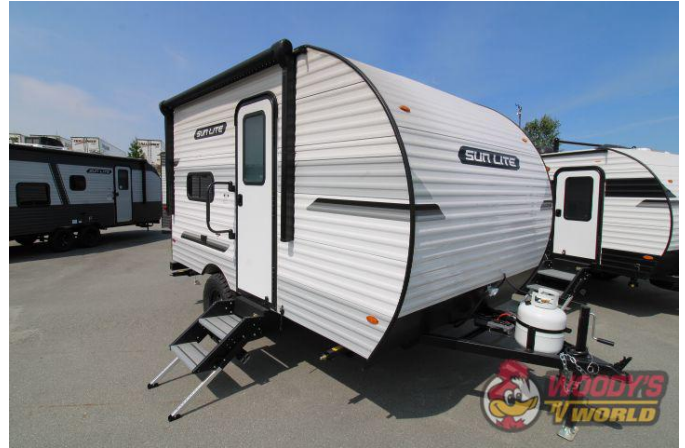
13 BH LTD