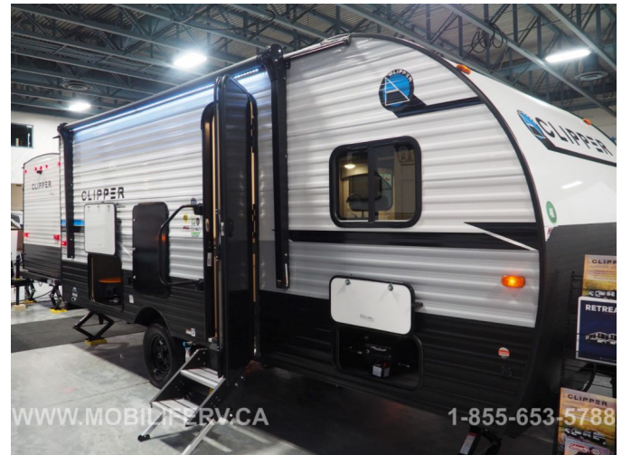
182DBU FLOORPLAN 4K Series

Disclaimer: Product information, pricing and photos are as accurate as possible and are subject to change without notice.