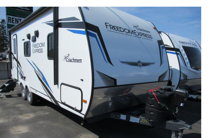
Berguson S RV WORLD

Originally <del>$46,875.00</del> $90 Weekly