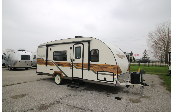
Light Weight Trailers | 19RBS